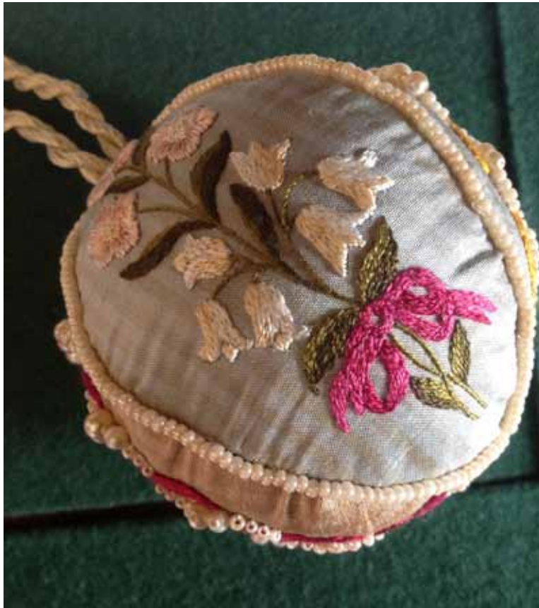
Above: A 'Stitch Off' embroidery

belonging to Jane Austen's brother Edward Austen (later Knight). They were putting on a major exhibition about Jane Austen's Emma to mark its 200th anniversary and wondered if they might give a home to a 'Stitch Off' display. Emma is especially preoccupied with the question of female accomplishments, after all.