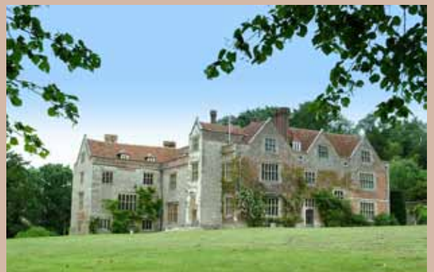
Chawton House Library

The exhibition commemorates a landmark in Jane Austen's publishing career and features manuscript materials, unique loan items and work from the Library's own collection. Emphasising the global world of the novel, and early 19th-century publishing practices, the exhibition sets the first edition of Emma alongside the first American edition (on loan from King's College Cambridge), and the first French translation (on loan from the University of Göttingen). Another section, which features the 'Stitch Off' display, concentrates on female accomplishments. The largest exhibition area focuses on Jane Austen's move to publish with John Murray and features first editions of works by several of Austen's female contemporaries and correspondence with them. An exciting highlight is Charlotte Brontë's letter on reading the novel (on loan from the Huntington Library in California).